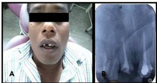
Figure 1: A- Fractured crown of 11, B- Radiograph of 11 and 21

front tooth region following a traumatic injury 3 days back. On clinical examination tooth no 11 showed complicated crown fracture with residual cement and a porcelain fused to metal full coverage restoration in 21 (Fig 1A). The patients had generalized stain due to history of habitual smoking since last 5 year. Radiographic examination showed tooth no 11 and 21 were endodontically treated (Fig 1B).