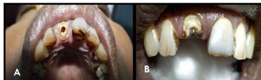
Figure 3: A- Space after removal of gutta percha in 11, B- Cementation of extrusion hook

After residual cement removal a space was created by removing gutta percha from the root canal space (Fig 3A) and the extrusion hook was cemented with type 1 glass ionomer cement (Fuji 1 by GC America) (Fig 3B).