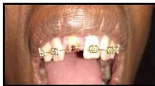
Figure 4: Placement of MBT bracket in upper anterior teeth

MBT brackets were bonded on Tooth no 13,12,21,22,23. A 0.014 inch round Ni-Ti wire were reshaped and placed in the bracket slots and the extrusion hook and secured with elastomeric ligation (Fig 4).