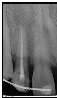
Fig 3: Obturation of #12