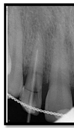
Fig 4: Fiber post luted with dual cure resin cement.